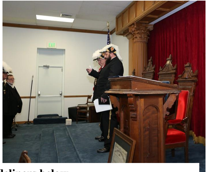
Some of the sideliners below