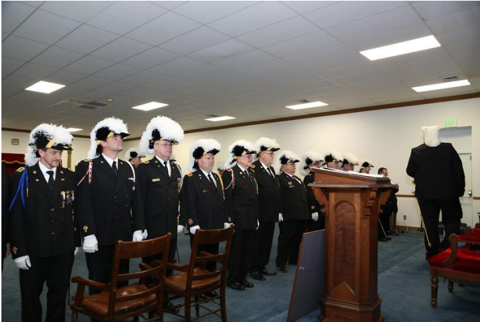
Receiving Distinguish and Introducing the Grand Commander.