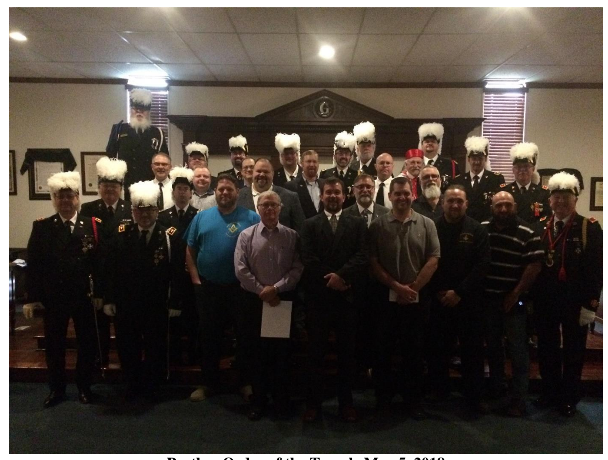
Prather Order of the Temple May 5, 2018 10 New Knights received the usual fine work at Prather Commandery.