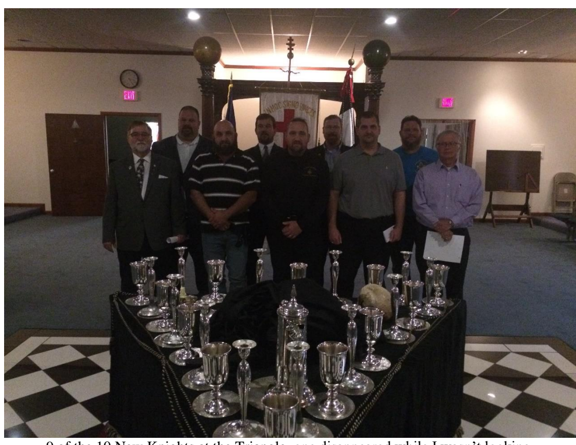
9 of the 10 New Knights at the Triangle, one disappeared while I wasn't looking.